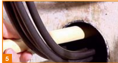
5 7KEDUULUPVWESODFGDSSURPPGS LQWKJFW