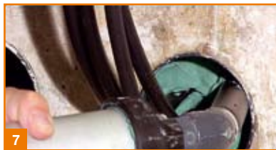
7 JLOOWKRSQLQWK67234TDWWRSSWRDSSURPPRIURPWKJURQW7K UPDLQLQVSDFLVILQOGLWKPRUWDU