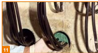
11 SSOWKPRUWDLURPFRWWRPWRWRSQWK UPDLQLQPPRIWKRSOLQ