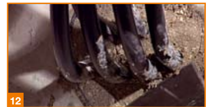
12 6PRWKWKPRUWDLWKDSWWQLI DQGDOLWQDWU

Paste suitable for sealing underground pipe and cable penetrations and hollow spaces against penetration of gas, moisture, stagnant water and groundwater leaks.