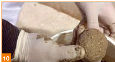
10 7KPRUWDLVRSUOPLGKQDILUP PDQDEQEDQEPDGLWKRWIDQOLQ DSDUW