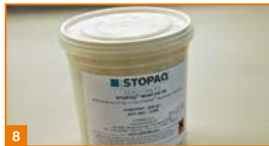
8 JRUULUWUDUGDQWDSOLFDFWLRQWV67234 ORUWDUJ5JRUJSSOLFDFWLRQVQLQWQYLURQPQWV DWUEDLVQV67234ORUWDU:5