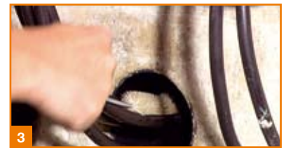
3 Clean the recess well with a brush and scouring pad and rinse with water if necessary. STOP5E® 5Euastop adheres to dry and wet surfaces. Coat the opening and cables with STOP5E® 5Euastop for good adhesion.