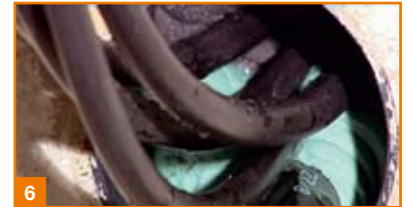
6 LIWKFDEQWOLKWODQGDSSOWK67234 TDWWRSLWKDKDQGGQVWKLEO QROWRILOODSSURPPRIWKJFVWLKRWDLU LQFOWLQVJLQOWKJFVWURPWKEDFWRWKIURQW