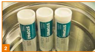
2 Preheat the cartridges to a temperature of 30 ° C.